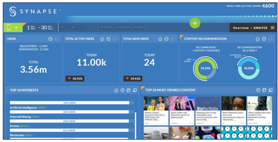
FIGURE 1: SYNAPSE DASHBOARD

personalized and highly-targeted product placements and offers. Content publishers can better understand their readers' needs and wants and in turn deliver them with highly targeted and personalized content to engage with. This directly reflects an increase in retention and engagement which has a positive impact on revenue for the business. OPN's technology can be used for both optimizing business processes as well as delivering a better customer experience.